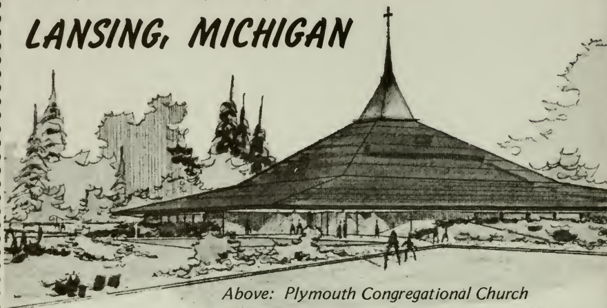
Above: Plymouth Congregational Church Host Church for the 1983 Annual Meeting