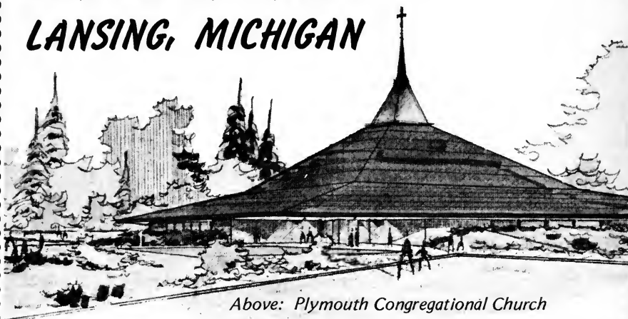
Above: Plymouth Congregational Church Host Church for the 1983 Annual Meeting