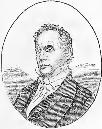
BORN APRIL 23, 1791. DIED JUNE 1, 1868. INAUGURATED MARCH 4, 1857.