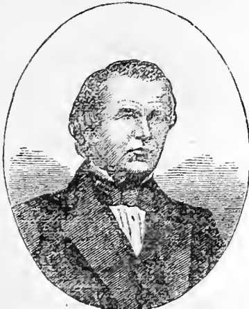
BORN DEC. 29, 1808. INAUGURATED APRIL 15, 1865.

Vegetine will cure the worst case of Scrofula.