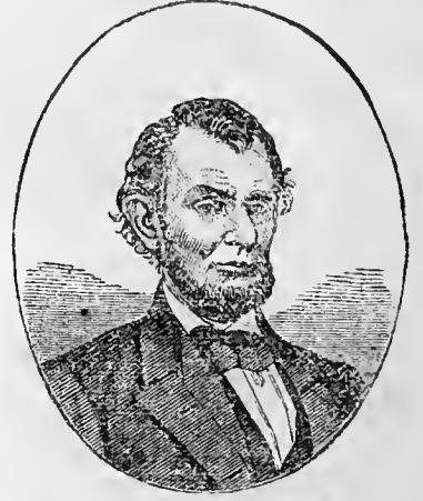
BORN FEB. 12, 1809. DIED APRIL 15, 1865. INAUGURATED MARCH 4, 1861.