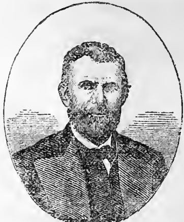
BORN APRIL 27, 1822. INAUGURATED MARCH 4, 1869.

Vegetine is now acknowledged by our best physicians to be the only sure and safe remedy for all diseases arising from impure blood, such as Scrofula and Scrofulous humors.