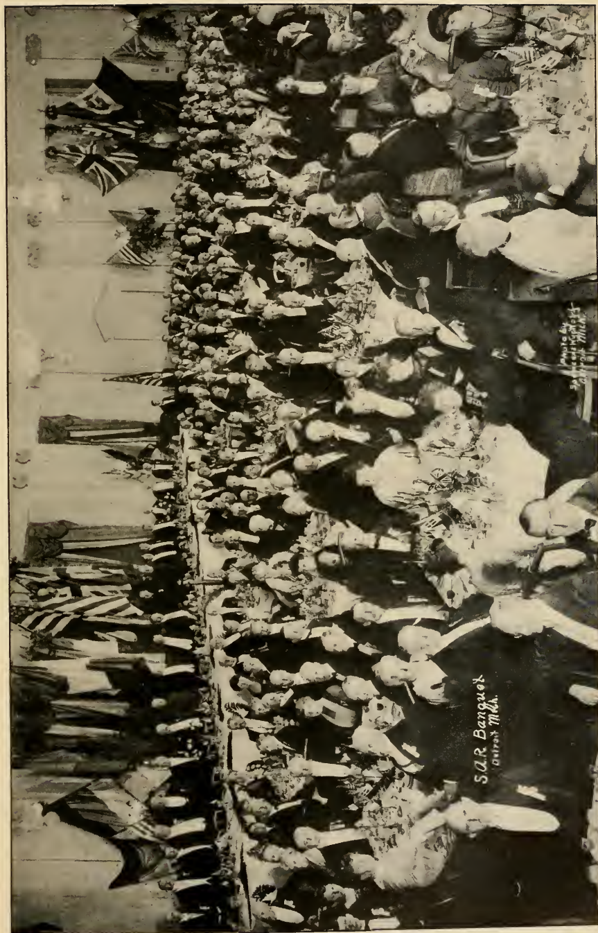
SONS OF THE AMERICAN REVOLUTION BANQUET AT DETROIT, MICH., MAY 20, 1919.