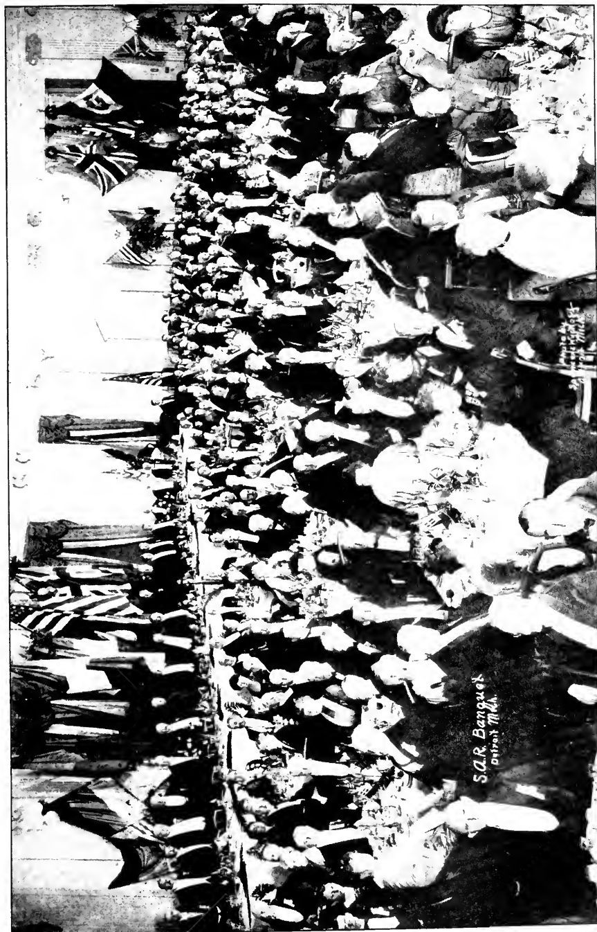
SONS OF THE AMERICAN REVOLUTION BANQUET AT DETROIT, MICH., MAY 20, 1919.