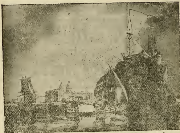
The old "Dreadnought" lying in the Thames off Greenwich.

The Merchant Seaman is dependent upon — the — "Dreadnought" for relief in time of illness or accident.