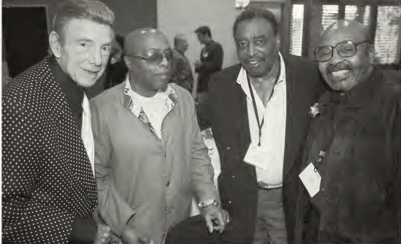
NEA Jazz Masters Louie Bellson, Roy Haynes, Chico Hamilton, and James Moody at the luncheon for the 2005 NEA Jazz Masters event in Long Beach, California.