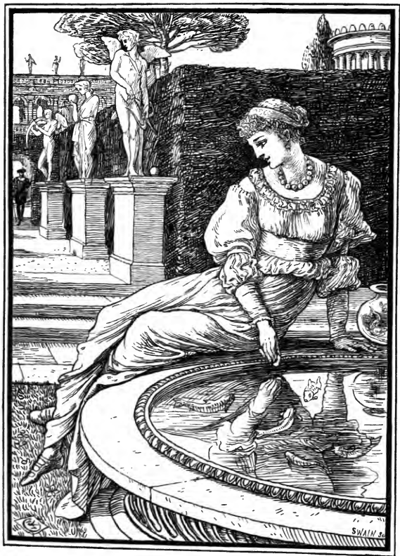
“She was in the garden, lying on the marble edge of a fountain, feeding the gold fish who swam in the water.”—FRONTISPIECE.