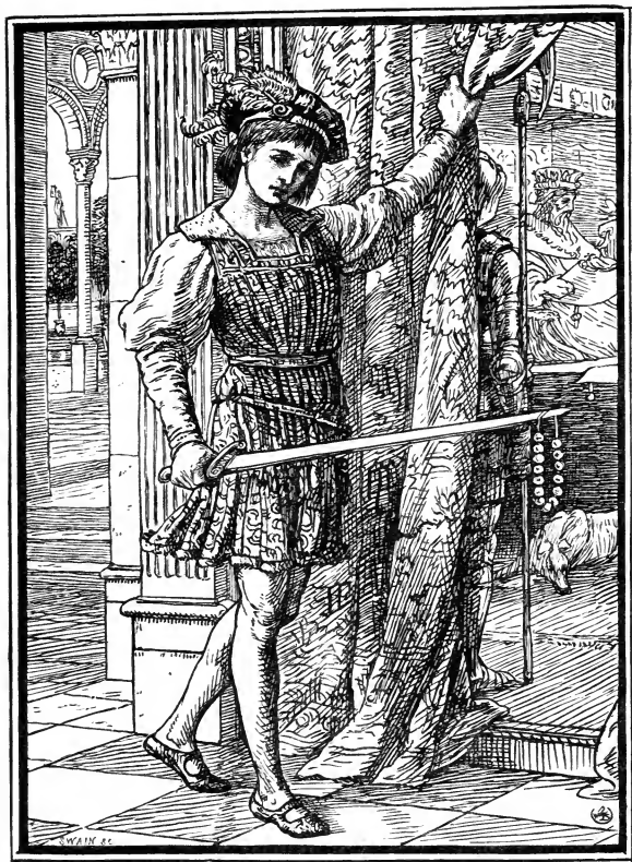
“Then he picked up the necklace on the point of his sword and carried it, slung thereon, into the council chamber.”—P. 39.