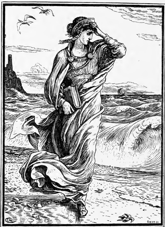
“Then the Princess left the cave and wandered down to the sea-shore.”—P. 178.