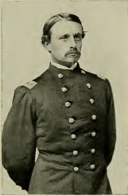
COL. ROBERT G. SHAW.