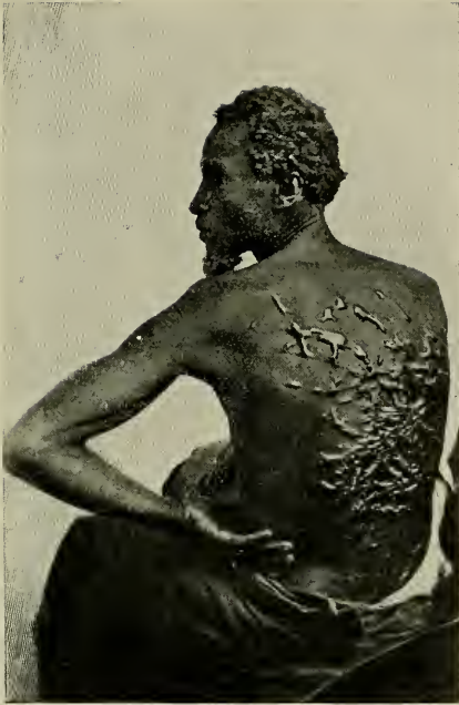
A LACERATED SLAVE. FROM BATON ROUGE, LA.