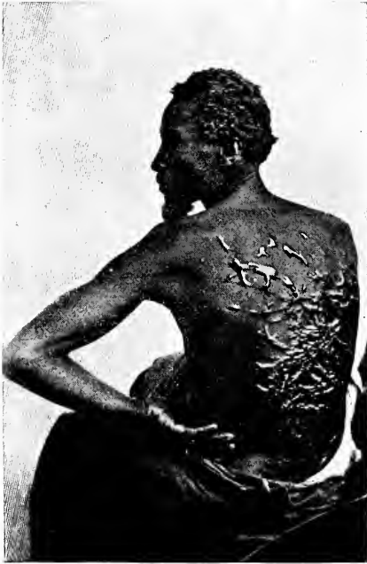
A LACERATED SLAVE. FROM BATON ROUGE, LA.