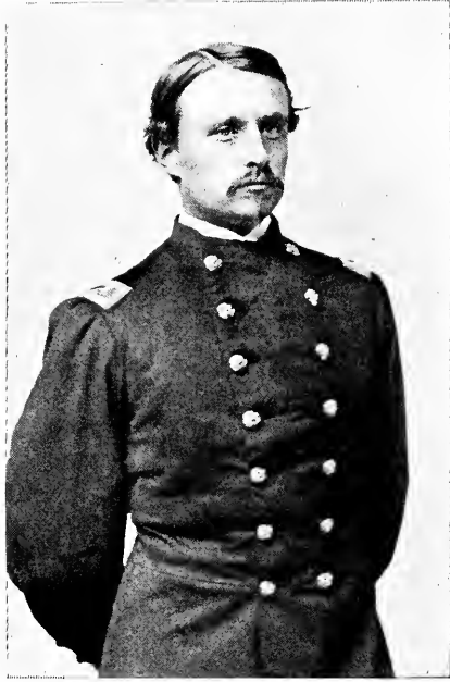
COL. ROBERT G. SHAW.