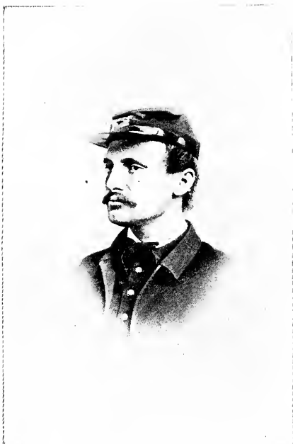
COL. EDWARD N. HALLOWELL.