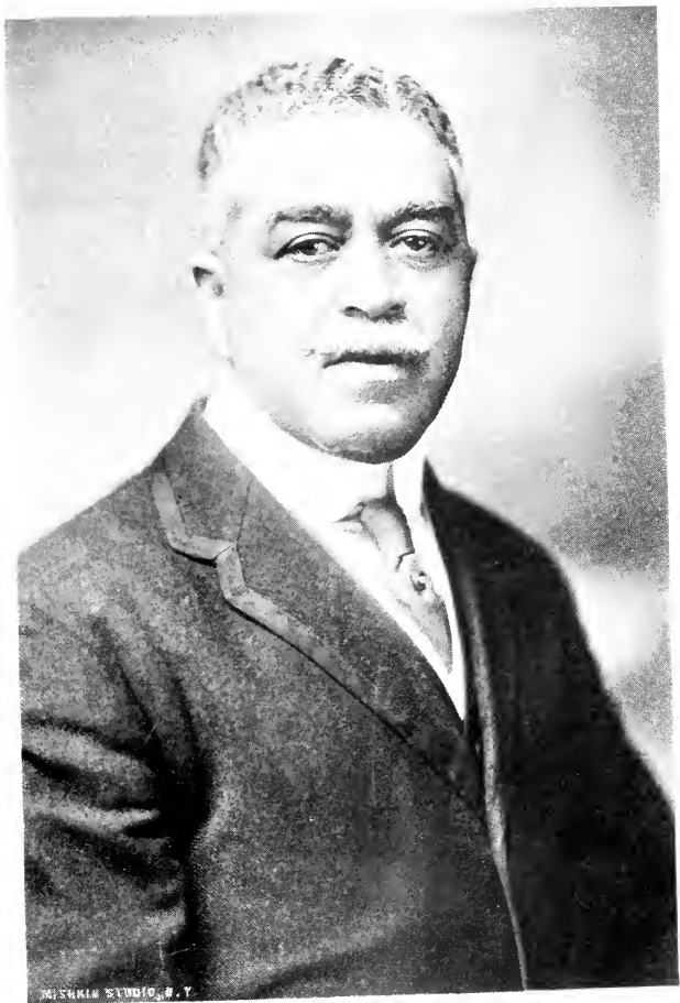
HARRY T. BURLEIGH