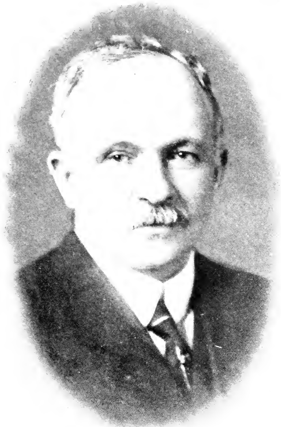
CHARLES W. CHESNUTT