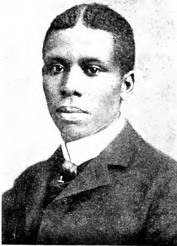
PAUL LAURENCE DUNBAR