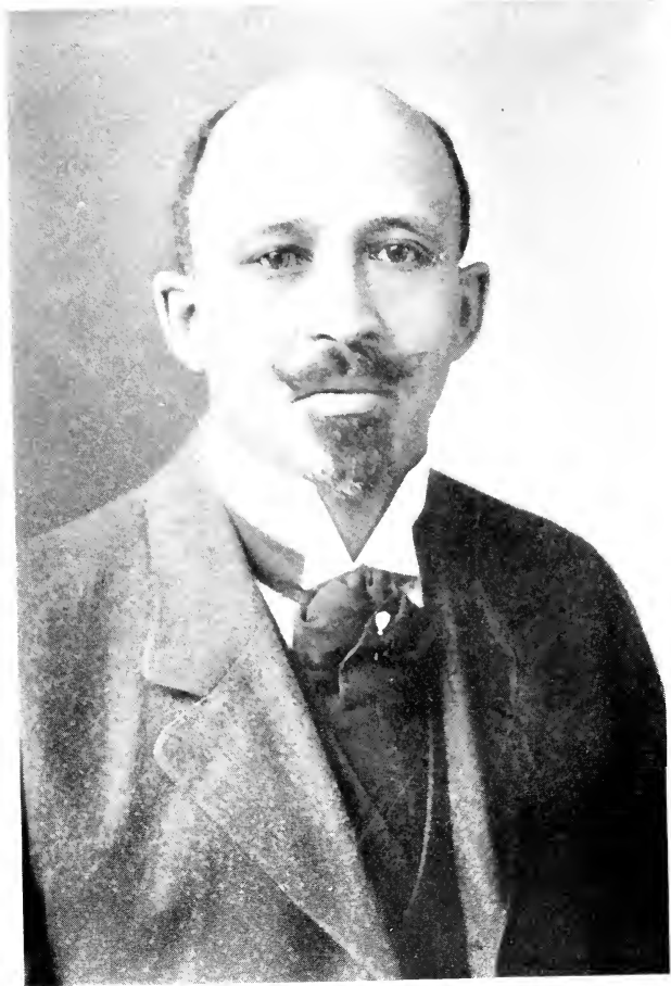
W. E. BURGHARDT DU BOIS