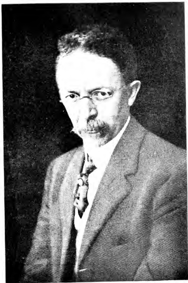
HENRY O. TANNER