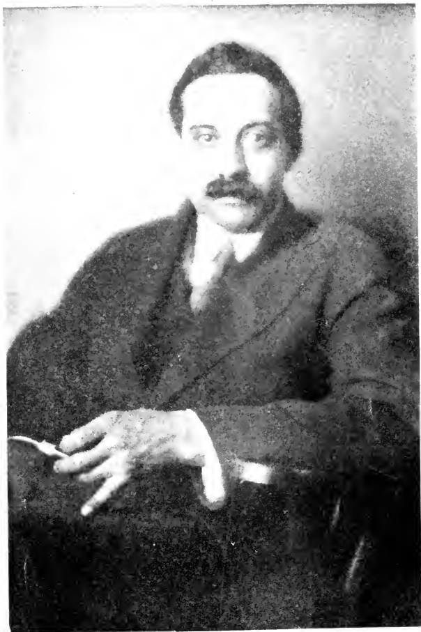
WILLIAM STANLEY BRAITHWAITE