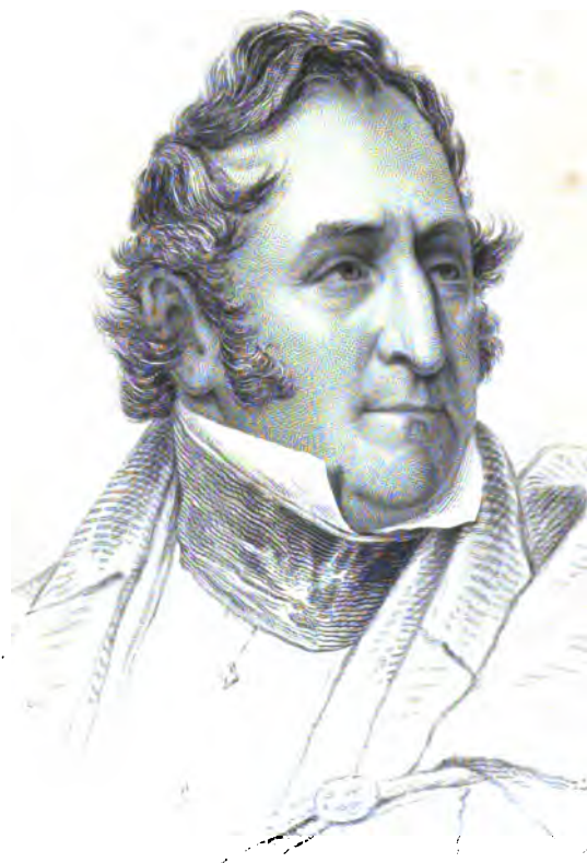
Thomas H. Benton.