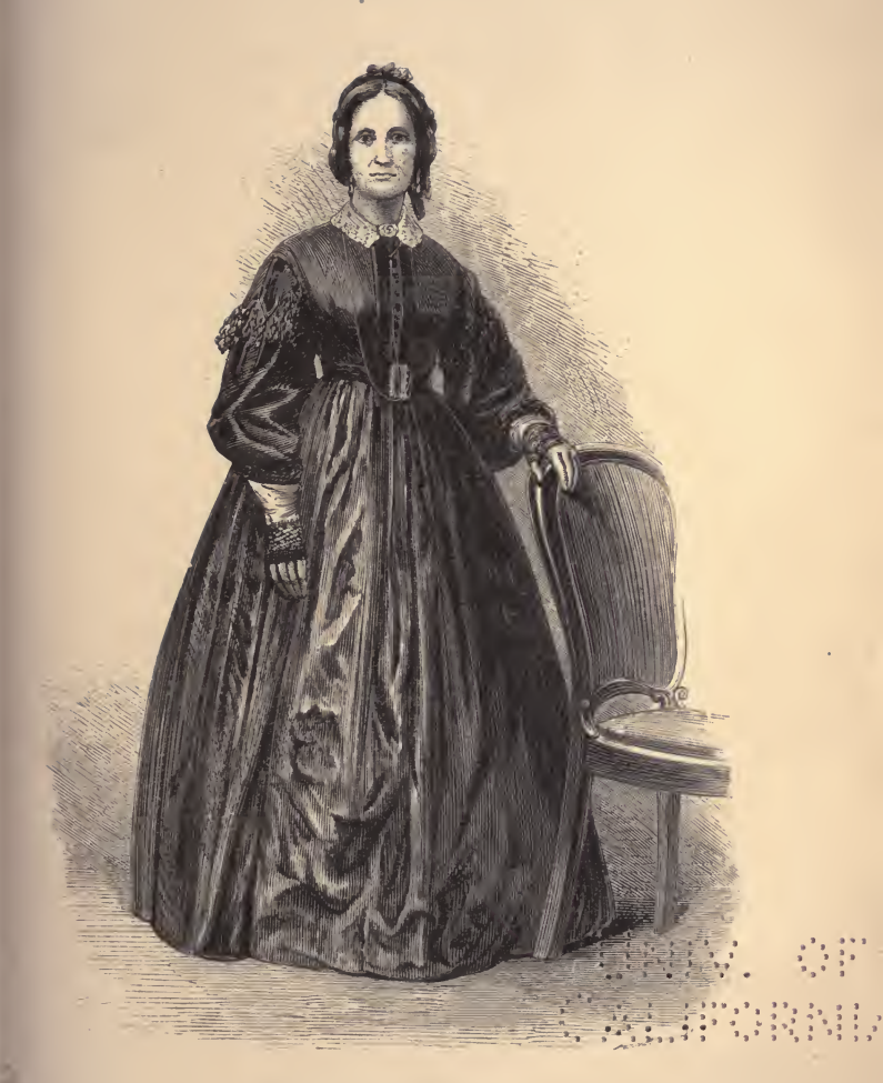
ELIZA SNOW, POETESS.