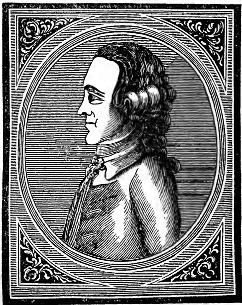
The Honorable JOHN HANCOCK, Esq; President of the American CONGRESS.