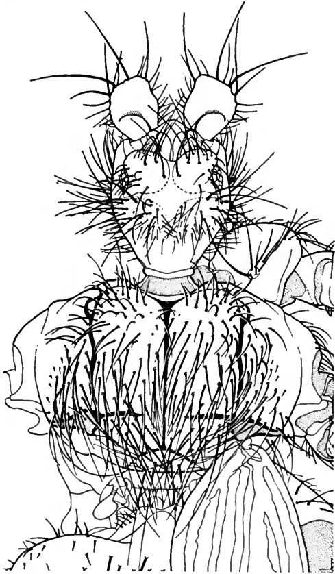
FIG. 27. Joblingia schmidti gen. et sp. nov. Dorsal view of head and thorax, showing chaetotaxy.

Description. —For the greater part of their extent, the latero-vertices are separated from the somewhat elevated occipital region only by a vague, non-membranous, transverse groove, which intergrades, on each side, into a membranous strip that is a dorsal continuation of the membranous area that separates the latero-vertex from the gena; along the midline, the latero-vertices are