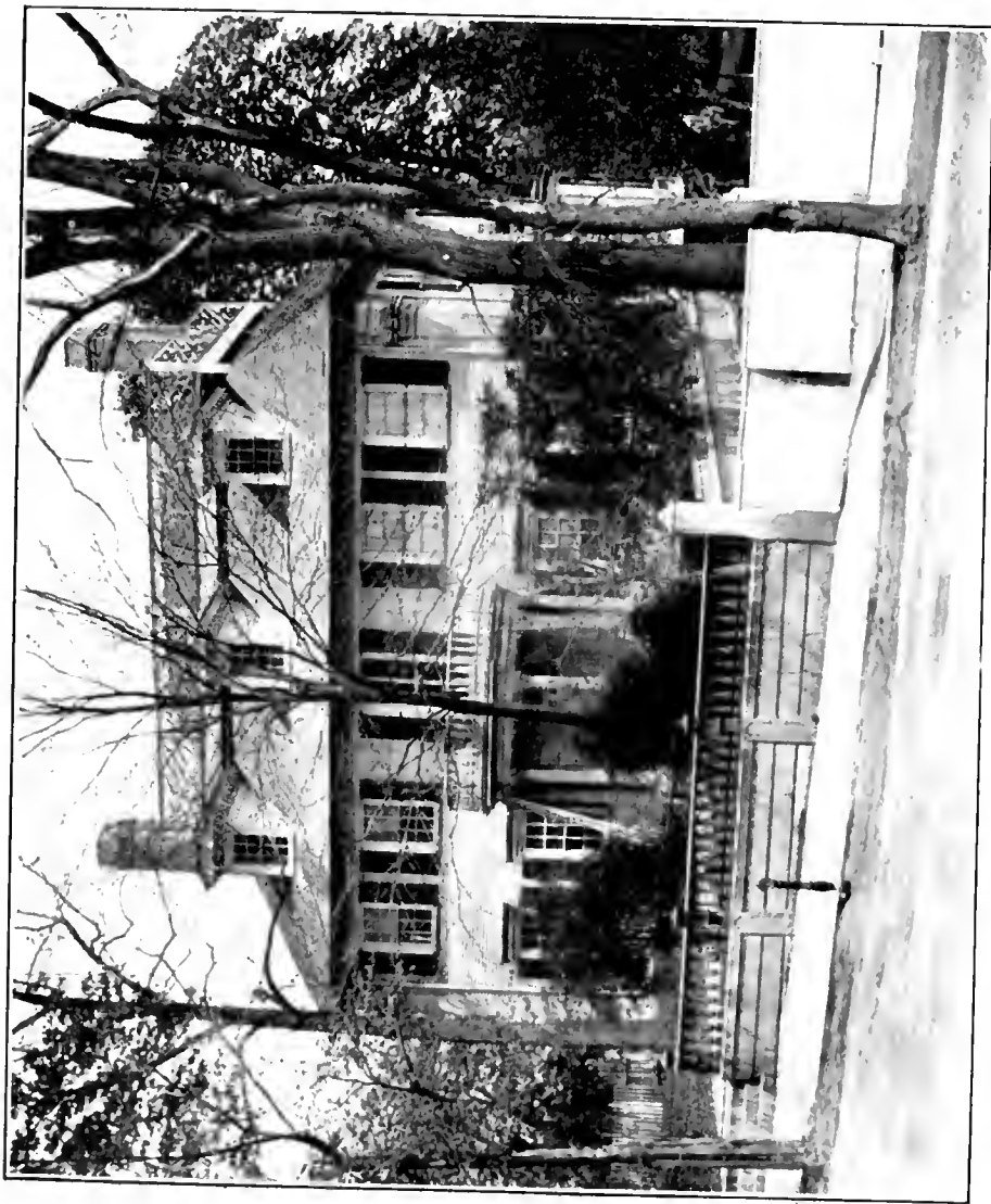
THE GOV. LANGDON HOUSE, PORTSMOUTH, N. H., ERECTED 1784. The New Hampshire building to be erected at the Jamestown Exposition is to be exactly like this house and furnished with furniture of the same style as that used by Gov. John Langdon. In this house Gen. Washington dined several times, during his visit to Portsmouth in 1789, and here later Louis Philippe, afterwards King of France, was entertained.