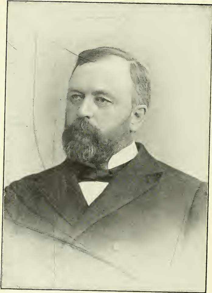
HON. CHARLES HENRY SAWYER.