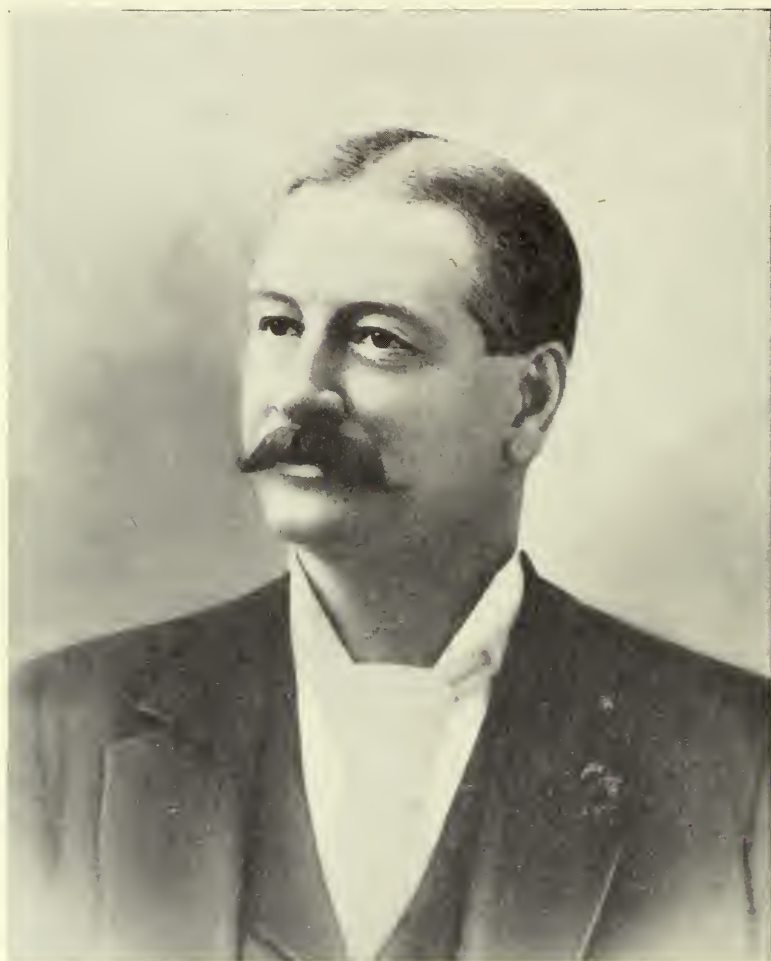
HON. CHARLES WOODBURY BICKFORD.