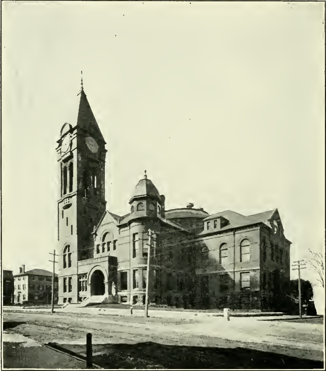
CITY HALL, DOVER, N. H.