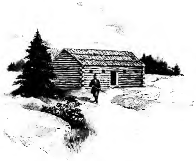
THE LOG MEETING HOUSE, CONCORD, N. H. 1726—1751.