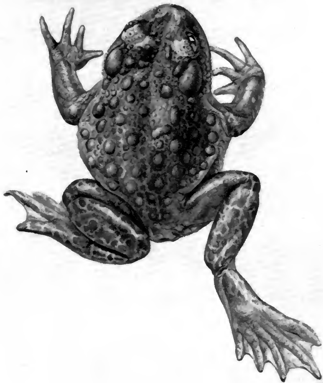
FIG. 1. Telmatobufo bullocki sp. nov., type; \times 1 .

1936, has a somewhat different preservation and its glandular warts are less prominent; otherwise it is a smaller replica of the type. The curious, boldly marked white eyelids, which might be thought to be a pathological character, are exactly duplicated in the paratype.