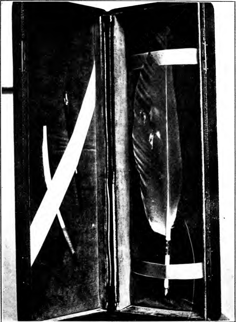
Act of 1910.—The Historic Pens.