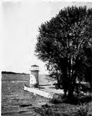
The Lake Wall and Chautauqua Lighthouse Erected 1940