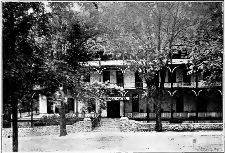
HISTORIC SPRINGS HOTEL