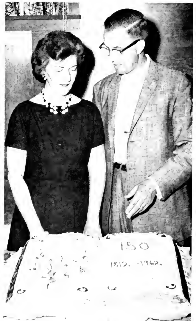
RIGHT—Sesquicentennial Cake at Alumni Banquet