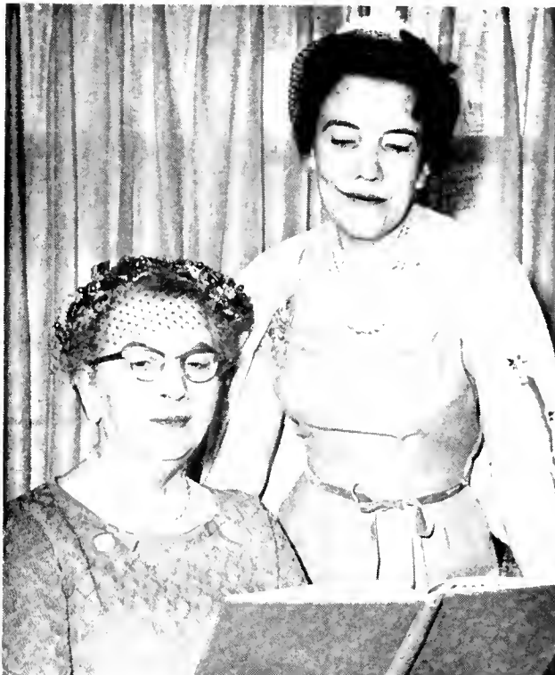
ABOVE—Mother-daughter Class Reunions