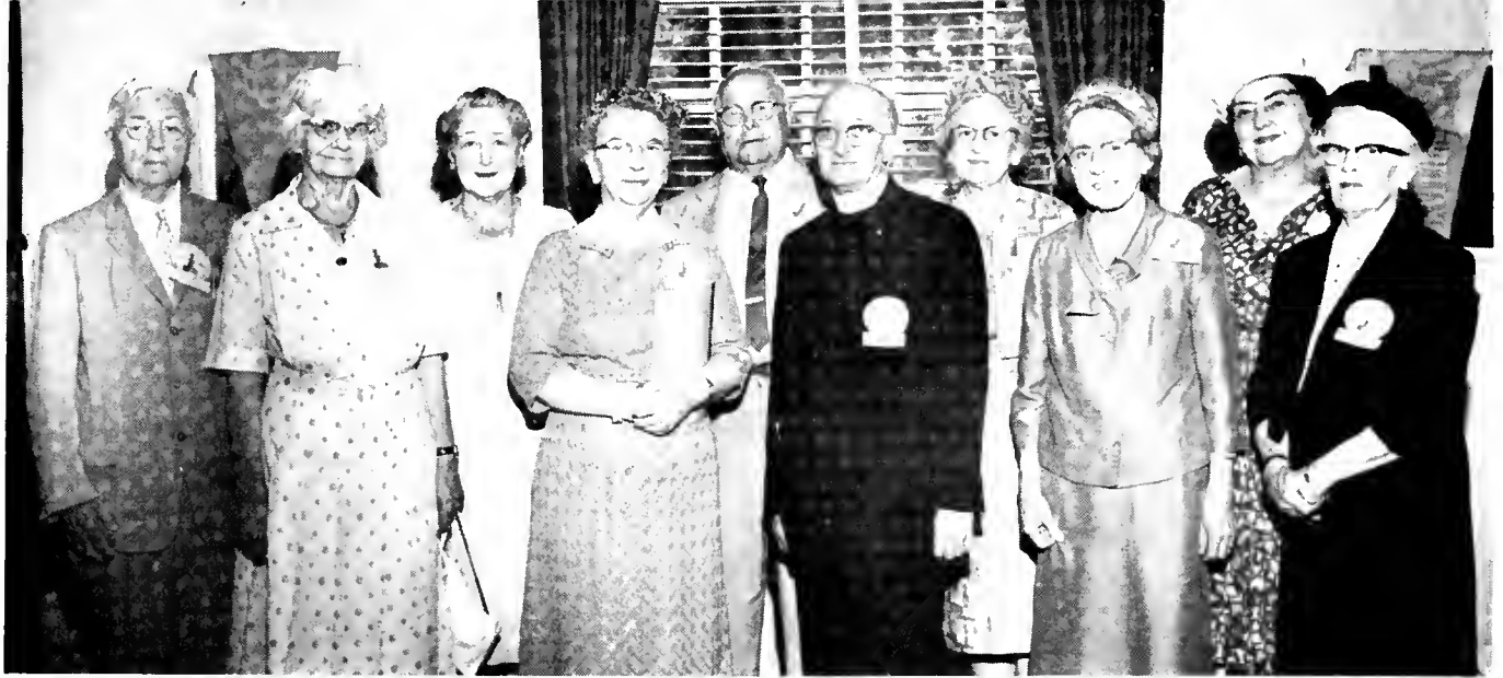
The largest 50th Class Reunion ever assembled on this campus—1912