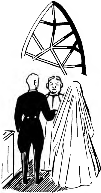
Do you both pledge to support the Alumni Fund?

The Fund didn't quite reach its goal, and they went back again to many of the donors, including the artist. "Certainly, I'll give again," he said. "I placed too low a valuation on my painting originally. It should be $200 and that doubles my gift."