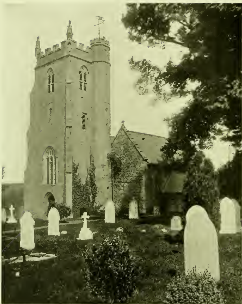
Parish Church of Upton Pyne, the Tower of which was built by Sir Herbert de Pyne about 1270.