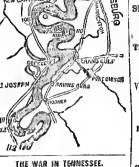
THE WAR IN TENNESSEE.