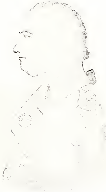
BRIGADIER GENERAL JAMES CLINTON