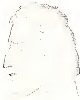
COLONEL MARINUS WILLETT