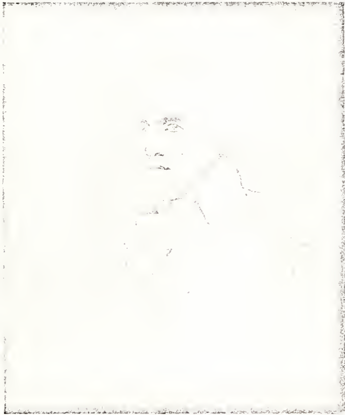
BRIGADIER GENERAL PETER GANSEVOORT