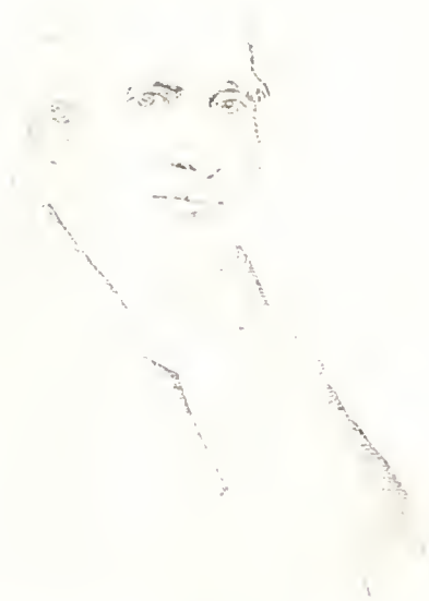
GOVERNOR GEORGE CLINTON