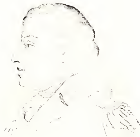
MAJOR GENERAL RICHARD MONTGOMERY