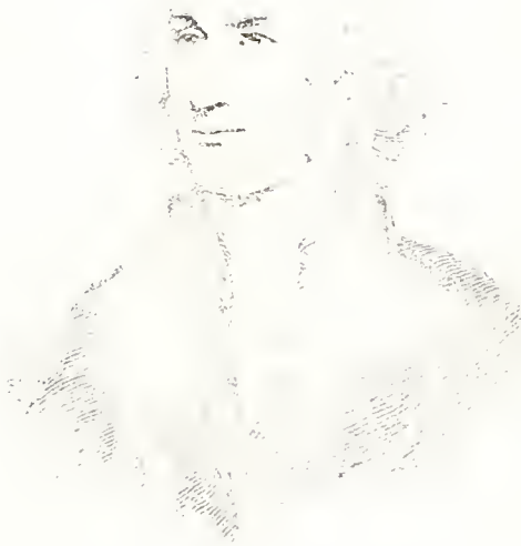
MAJOR GENERAL PHILIP SCHUYLER