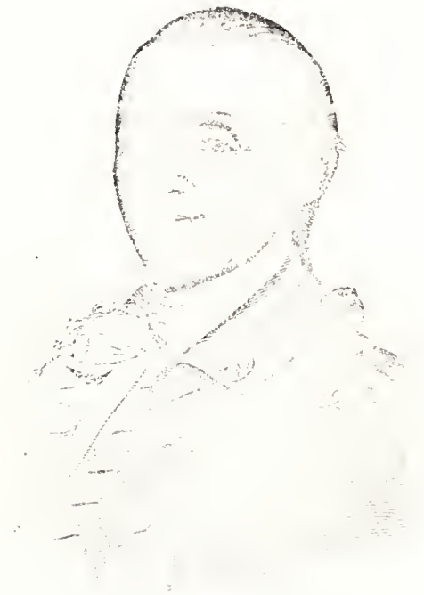
COLONEL PHILIP VAN CORTLANDT