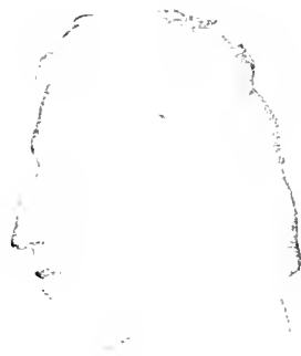
COLONEL MARINUS WILLETT