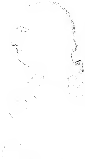
BRIGADIER GENERAL JAMES CLINTON