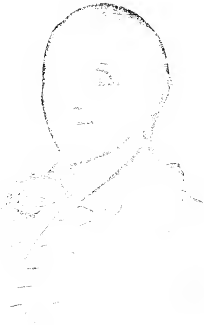
COLONEL PHILIP VAN CORTLANDT