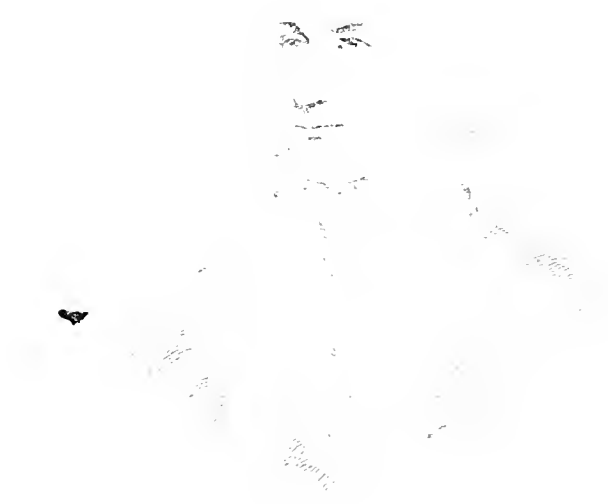
MAJOR GENERAL PHILIP SCHUYLER