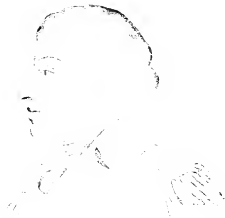
MAJOR GENERAL RICHARD MONTGOMERY