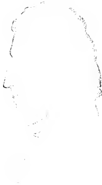
COLONEL MARINUS WILLETT