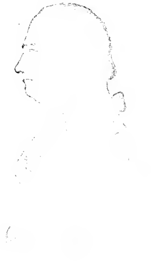
BRIGADIER GENERAL JAMES CLINTON