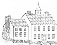
Steadman House. BUILT IN 1760, BURNED IN 1813