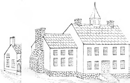
Augustus BUILT IN