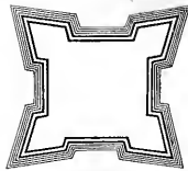
Fort Little Niagara.