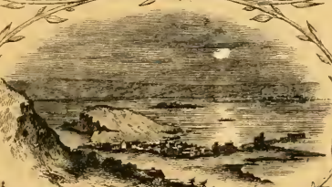
CROSSING AT QUEENSFERRY BY MOONLIGHT