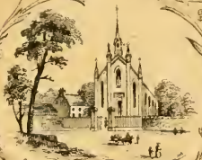
CHURCH AND MANSE OF LONGBOICE