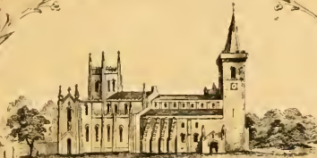
DUNFERMLINE ABBEY AND CHURCHYARD