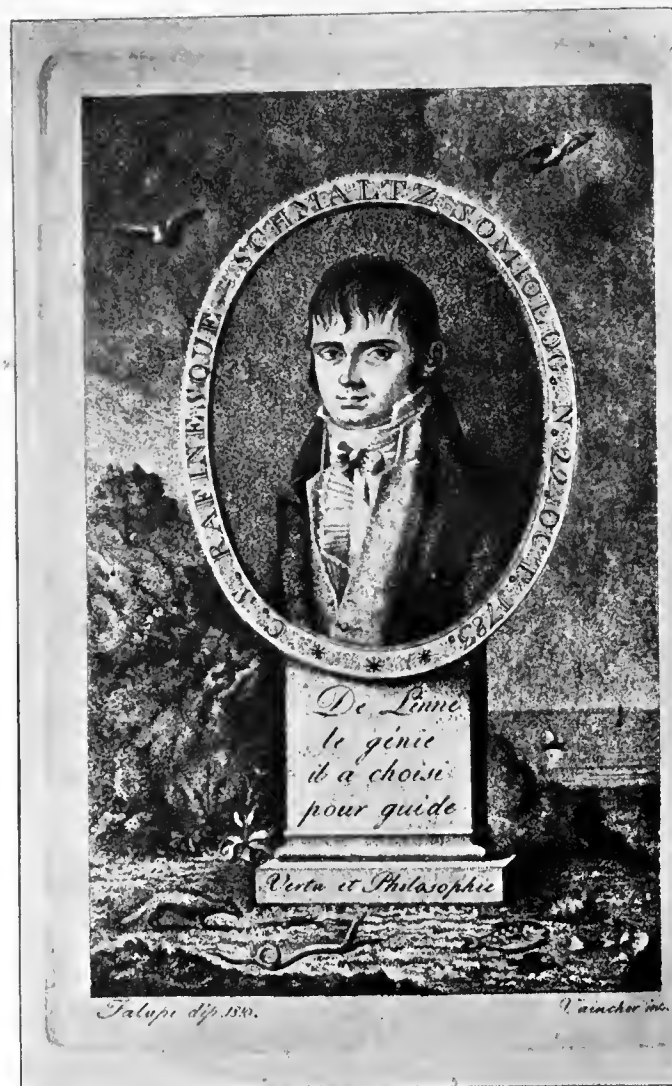
FROM THE "ANALYSE DE LA NATURE."