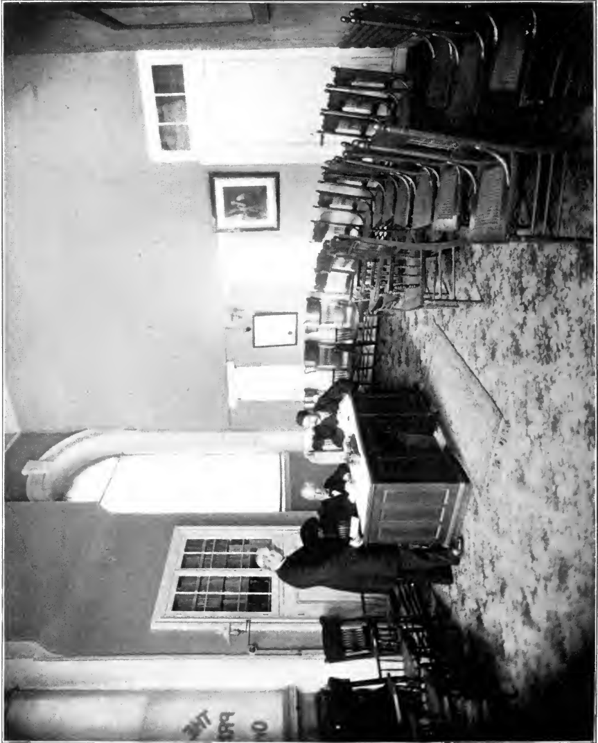
OFFICE OF THE PENNSYLVANIA PRISON SOCIETY.