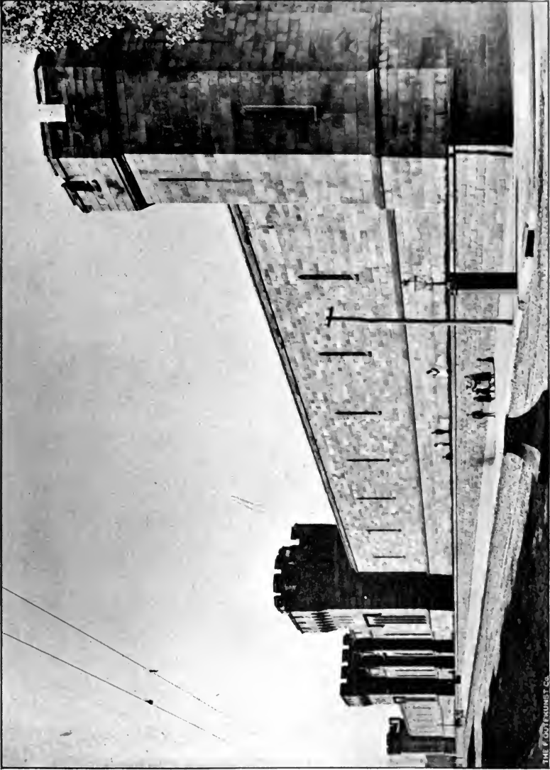
EASTERN STATE PENITENTIARY,