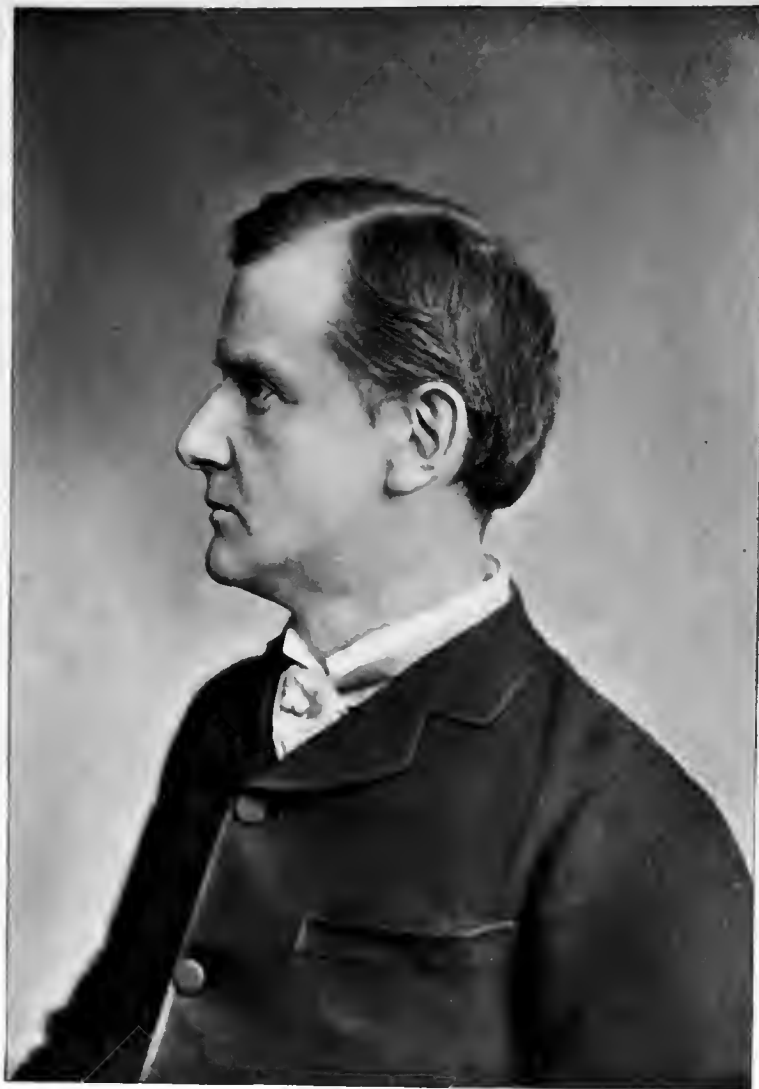
John Mason Brown