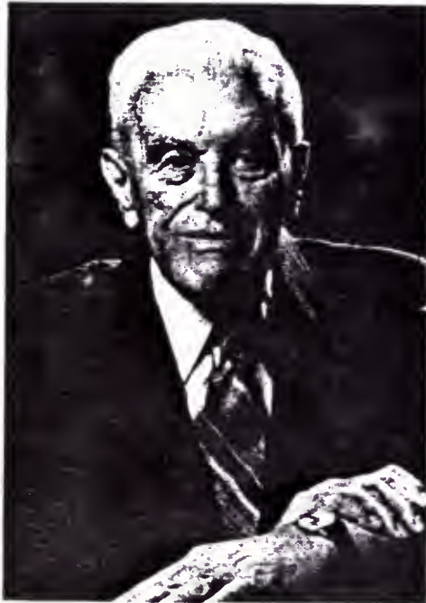
John C. Harsanyi 1920 - 2000