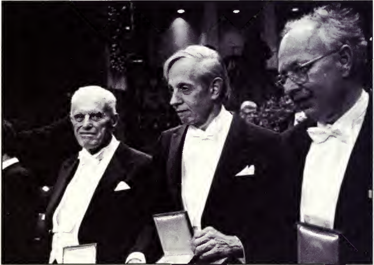
John Harsanyi, John Nash, and Reinhard Selten at the awarding of the Nobel Prize in Economics, Stockholm, Sweden, December 10, 1994.