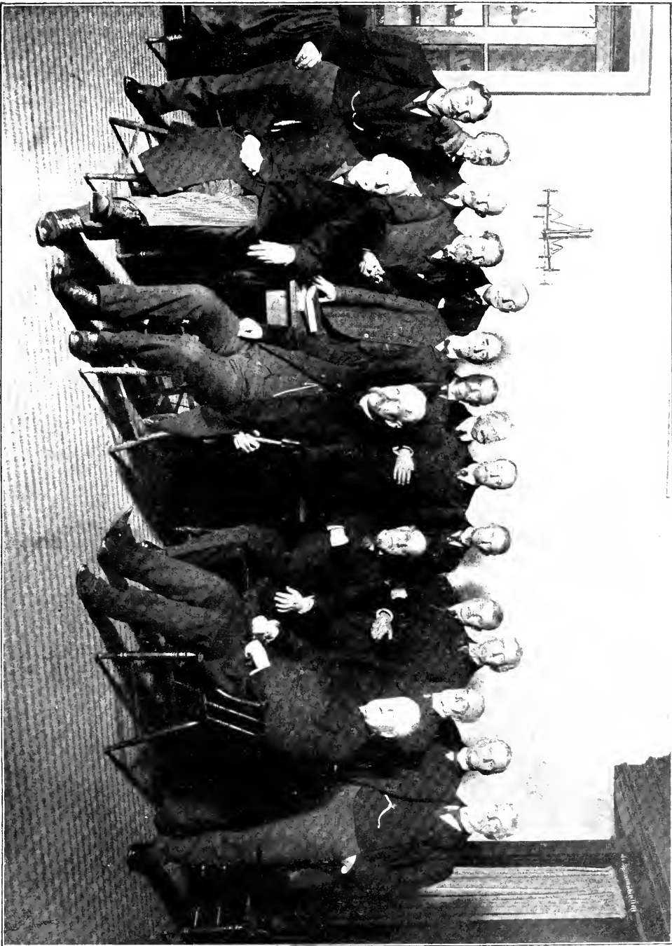
ELDERS, DEACONS AND TRUSTEES OF NORTHMINSTER CHURCH.