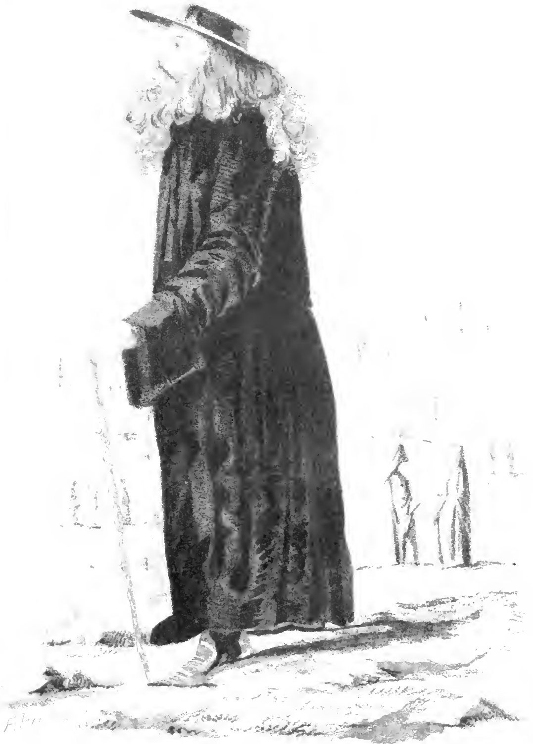
WESTIC INN AND PRIEST