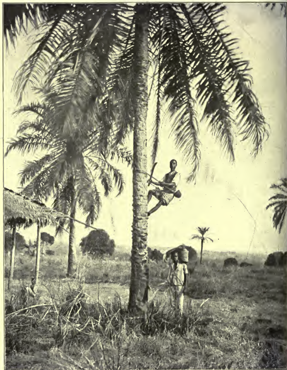
CLIMBING A PALM-TREE FOR PALM-WINE.