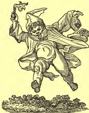
Alter et Idem.