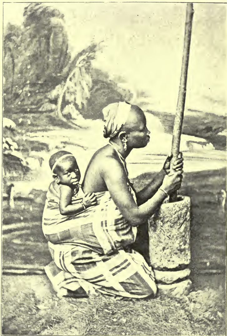
FJORT MOTHER AND CHILD.