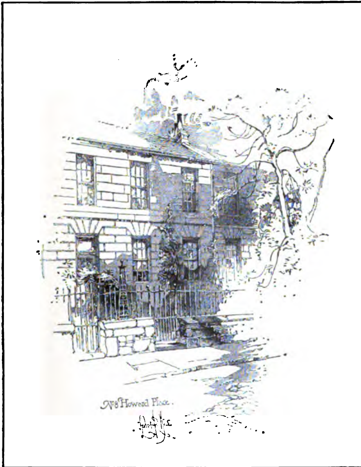
BIRTHPLACE OF ROBERT LOUIS STEVENSON, EDINBURGH.