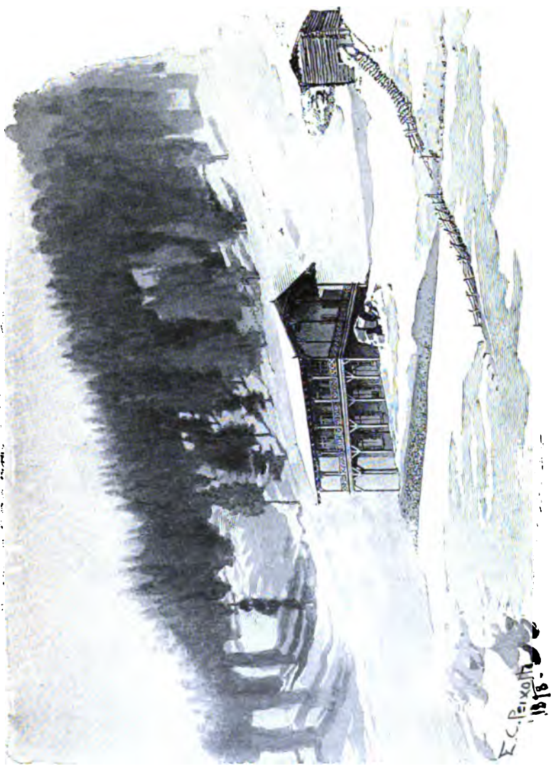
CHALET AM STEIN, DAVOS-PLATZ, IN 1881-82.