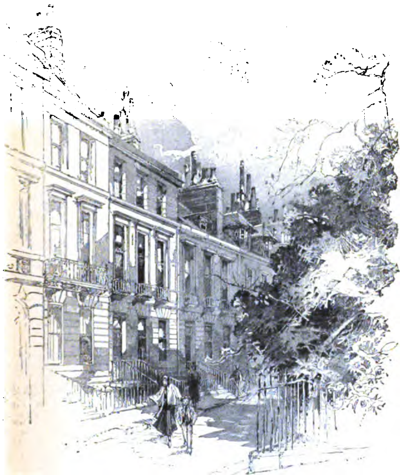
EDINBURGH HOME OF THE STEVENSON FAMILY, 1853-1887.