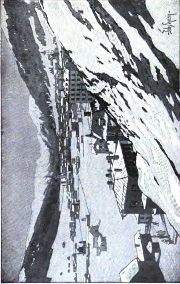
GENERAL VIEW OF DAVOS.