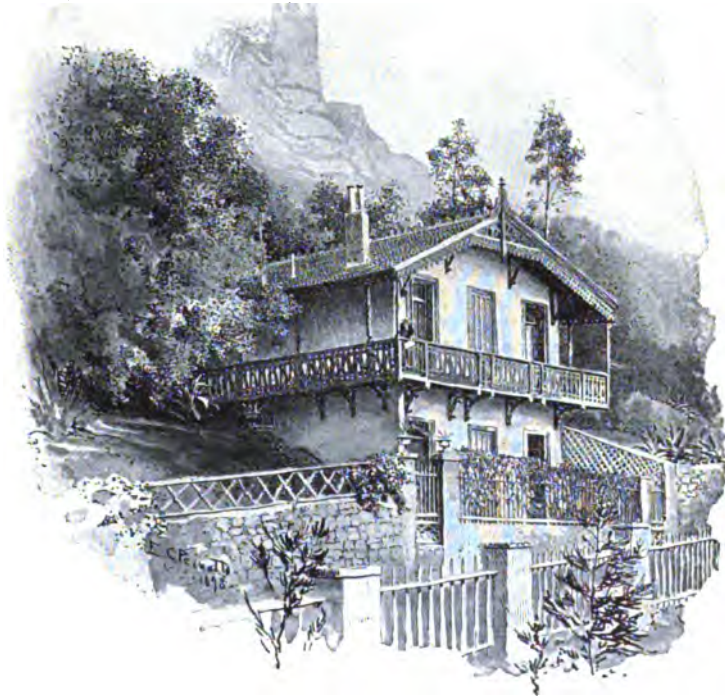
CHALET LA SOLITUDE, HYÈRES.