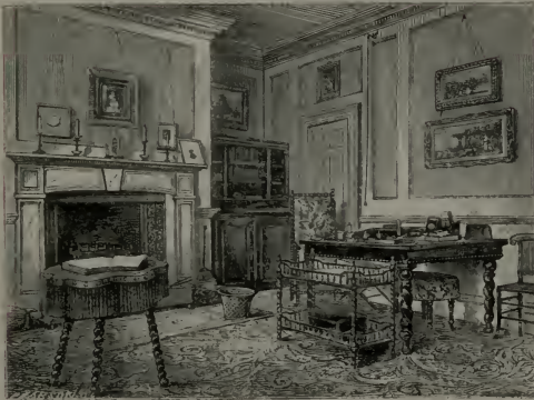
HUGHENDEN MANOR THE STUDY

'The Commonalty murmured, and said, "There never were so many Gentlemen, and so little Gentleness."' BISHOP LATIMER.