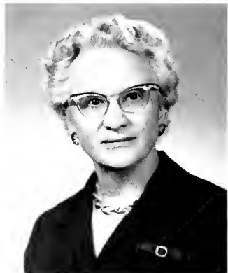
. . . and in the early sixties.