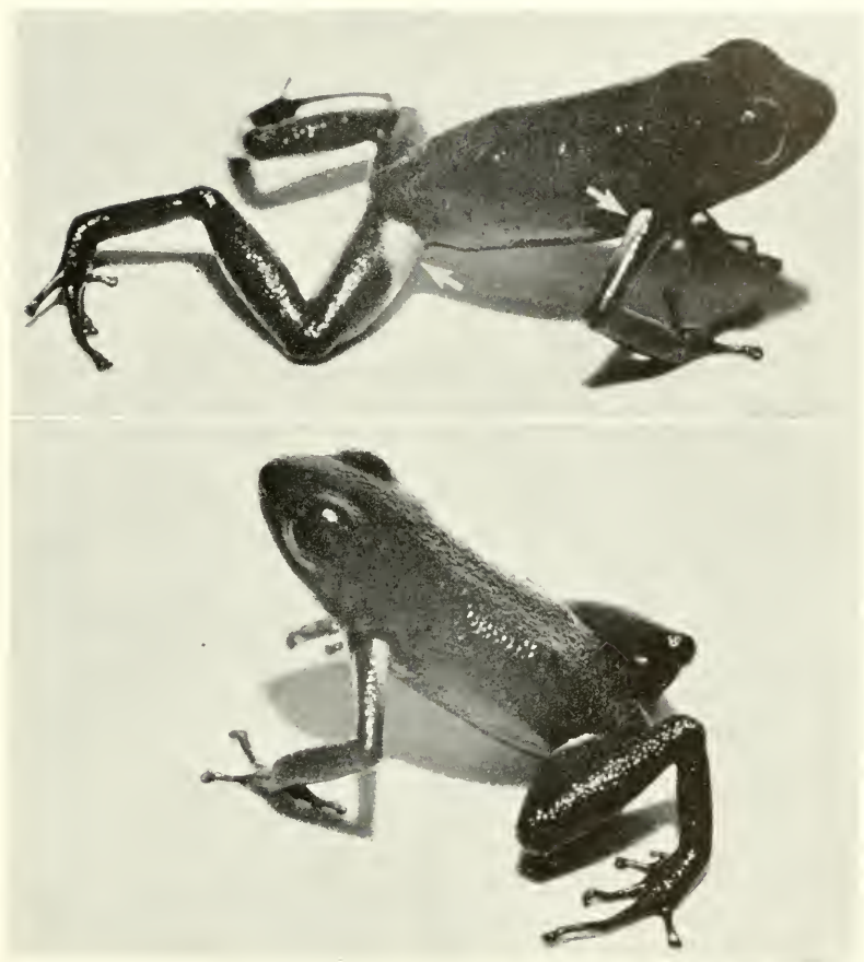
FIG. 1.— Dendrobates abditus , new species. Two views of the holotype in life, \times 3.4 . Arrows denote the golden orange flash marks, which are the only markings on a frog that is otherwise unicolored dark bronzy brown above and below.

edges upper eyelids. Eyes prominent, nearly equal to length of snout. Snout short, sloping, truncate in dorsal or ventral aspect, and rounded in lateral profile. Naris directed laterally; both nares visible from front, barely visible from below, but not visible from above; nares much closer to tip of snout than to eye. Canthus rostralis rounded; loreal region flat or very slightly concave and nearly vertical. Tympanum a vertical oval, rather indistinct and no greater than one-half area of eye; not visible posterodorsally (where tympanic ring is subcutaneously overlain by anterior edge of m. depressor mandibulae ).