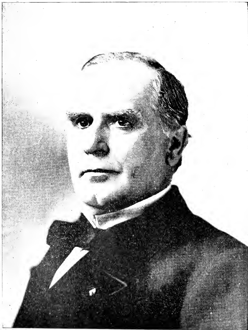
MAJOR WILLIAM McKINLEY, Jr., of Ohio, Republican Candidate for President.