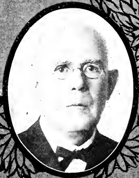
Bishop ELIJAH EMBREE MOSS Died 1919