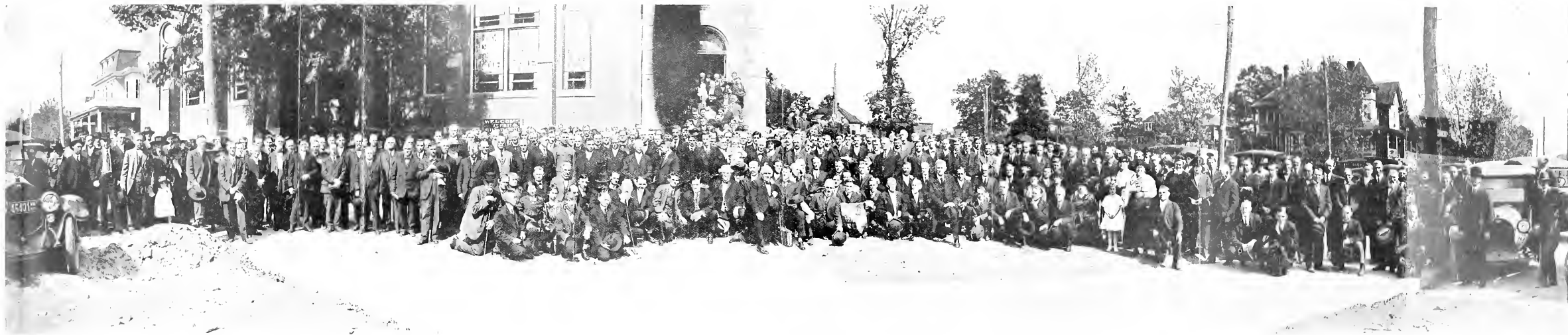
CONFERENCE AT PRINCETON