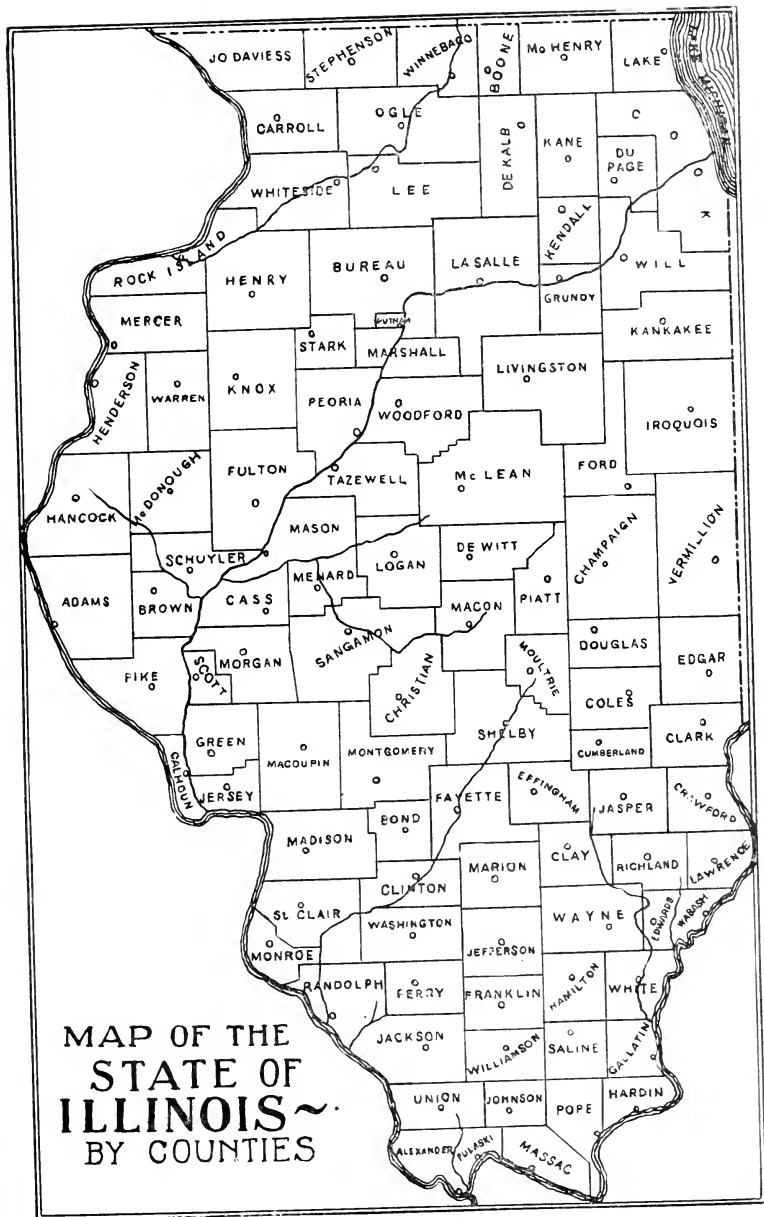
MAP OF THE STATE OF ILLINOIS BY COUNTIES