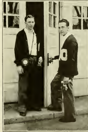
"ROBBY" AND "PETE" — Watchmen

Strangely enough, the gridmen are not anxious for warm weather to