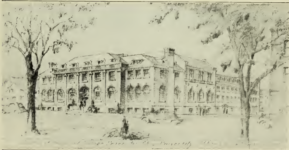
Architect's Sketch of Proposed New $250,000 Student Union Building

Bulletin: In the student poll, 1725 votes were cast in favor of the $2.50 fee, and 324 against.