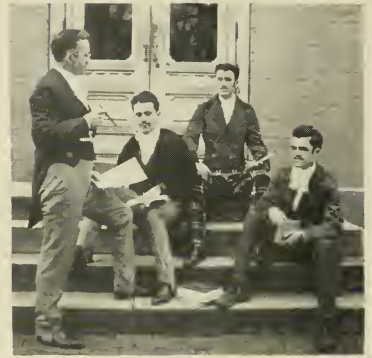
Four Earnest Students on Cutler Steps

"The forefathers of the university were men whose vision had projected itself for 150 years into the future. Ohio University was a part of that vision, being conceived by the same