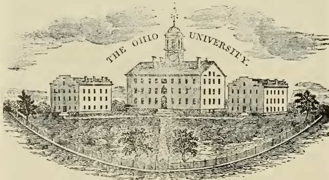
Ohio University as It Appeared to an Artist in 1838