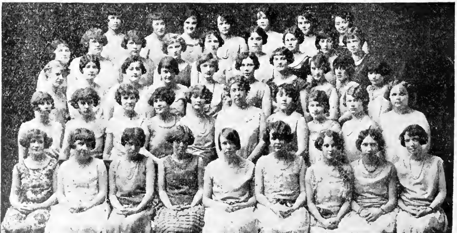
GIRLS' GLEE CLUB — 1925 CUP WINNERS