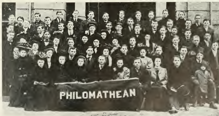
PHILOMATHEANS asserted in 1908 that "the best astrologers have averred that long life, health and prosperity attend those who have taken the Philo vow and inscribed their names upon the Philo roll."

Although the secrecy, smugness, and assumed superiority of society members was sometimes denounced, and at times the methods of membership selection were condemned, few can question the fact that the literary society was a definite asset to Ohio University students throughout the 19th and early part of the 20th Century.