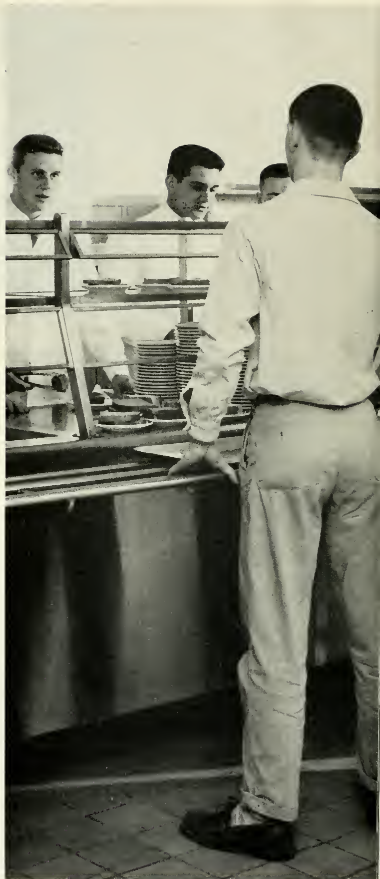
FOOD—More than 430 students handle one of the major expenses of a college education by working at board jobs. These students earn three meals a day by working approximately 2½ hours per day.

The work-study plan which more and more college students are involved in, proves to be a good course of action for reasons other than helping out along the budget lines. This plan also provides opportunities for them to gain sociological and psychological security as well as a foundation and motivation for the career they will enter. There is a certain sense of satisfaction to know you personally have provided some of the funds for your education and, of course, a great deal of satisfaction for those who foot the whole bill.