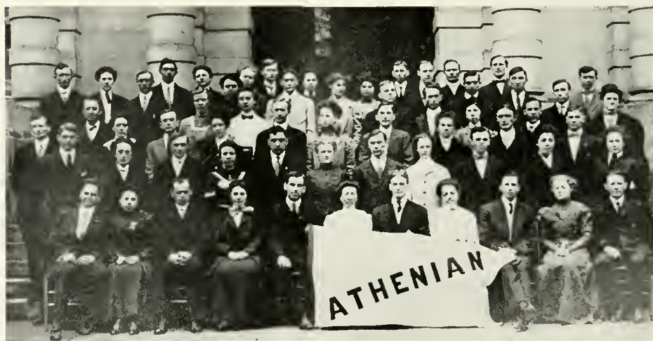
ATHENIAN members in 1910 declared that their organization "stands today in conformity to the spirit of the times; passing from the puritanic spirit of the founders to the tolerant spirit of the present day."

When delinquents refused to pay fines, a formal charge