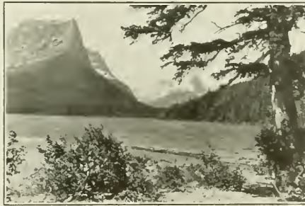
LAKE ST. MARY—GLACIER NATIONAL PARK

POLITICS on the Ohio University campus have taken a tremendous increase in intensity this year as time for the annual spring election approaches. Following the referendum vote on a petition to abolish political parties, the Campus Affairs Committee decided to continue the present system. For the past four years, the Toupee Party has controlled matters, but this year indications are that the