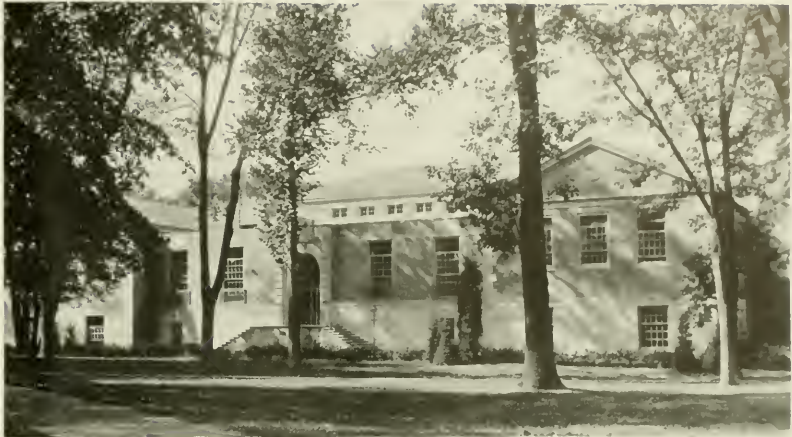
EDWIN WATTS CHUBB LIBRARY

Education with a major in the School of Commerce. The degree is Bachelor of Science in Education.