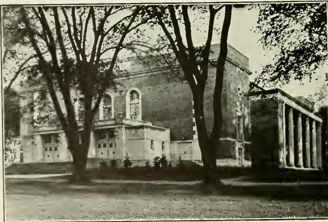
ALUMNI MEMORIAL AUDITORIUM

While taking a course leading to the degree of Bachelor of Arts, a student at Ohio University may elect such studies in the College of Education as entitle him to receive a certificate from the State Department of