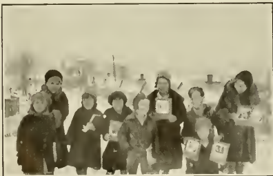
GROUP OF "Y. W." SUNDAY SCHOOL CHILDREN

The social service program of the Y. W. is in part supported by funds received each Christmas Season from the operation of a "Triangle Gift Shop." A room in West Wing is attractively decorated and a wide variety of gifts displayed. Faculty women and students are generous in their patronage.