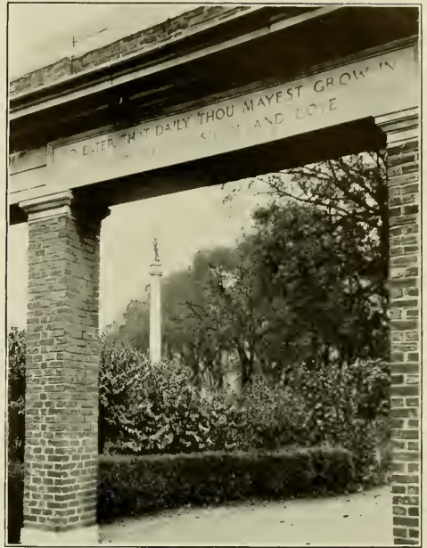
THE ALUMNI MEMORIAL GATEWAY

And now, as to the origin of the gateway inscriptions. Recent inquiries